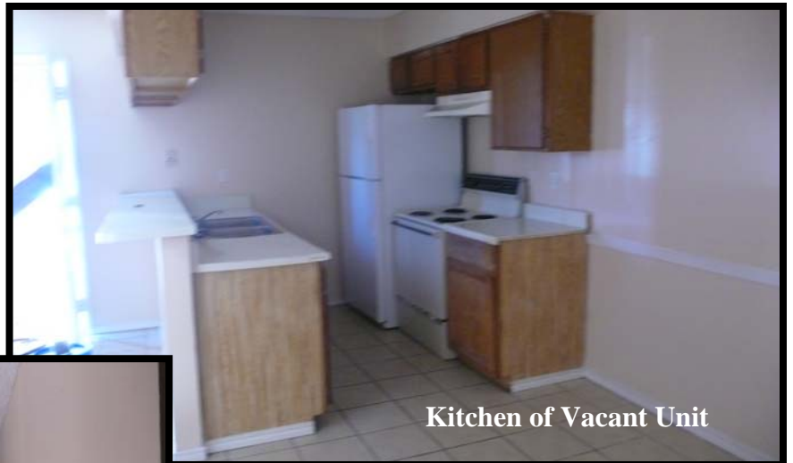
Kitchen of Vacant Unit

Well Maintained & Clean Investment Property Tiled Floors ~ All Units Fresh Paint Interiors ~ Vacant Units & Other Units Fresh Paint Exterior Fenced, well maintained Little deferred maintenance Management willing to work with new Owner