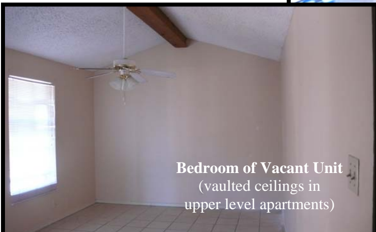
Bedroom of Vacant Unit (vaulted ceilings in upper level apartments)

PLEASE CALL FOR TOUR DO NOT DISTURB TENANTS